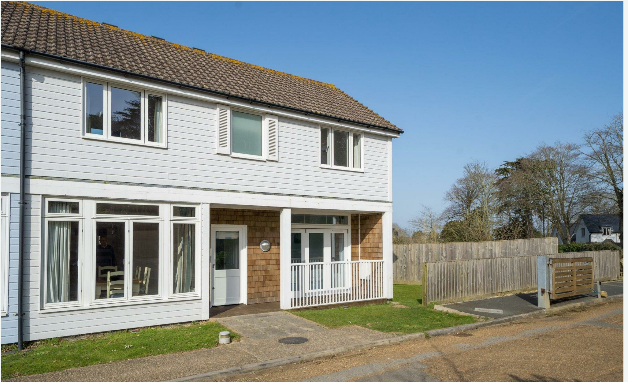
Piedmont K1 The West Bay, Norton, Yarmouth, Isle Of Wight, PO41 0RJ